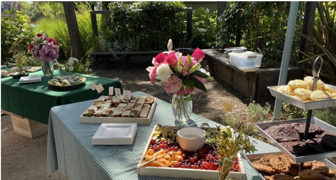
Delicious food and wine made everyone feel at home.