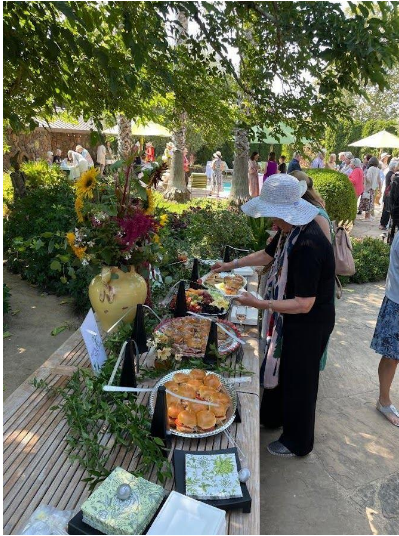
The buffet and small bites were catered by Whole Foods .