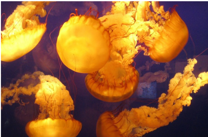
Photo: Jellyfish display, Ocean Journey building, the Tennessee Aquarium.

Once formalized, the consolidation fundamentally changed the operational structure and staffing of the three institutions. Although each retained its individual identity and continued to be governed by its respective board, the institutions now share four directors: HR, Finance/Accounting (CFO), IT and Marketing, and Retail Sales. This structure is at the core of the consolidation, and as the lead partner, the Aquarium employs the four shared directors who report to the Aquarium's CEO as well as the Directors of the CDM and the Hunter.