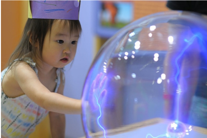
Photo: Inventors' Clubhouse, Creative Discovery Museum.

connections to the community and provide educational support to schools and social service agencies. In addition to the cost savings and revenue generated for the Aquarium, the consolidation enabled the museums to undertake a joint fundraising and capital campaign that raised $120 million.