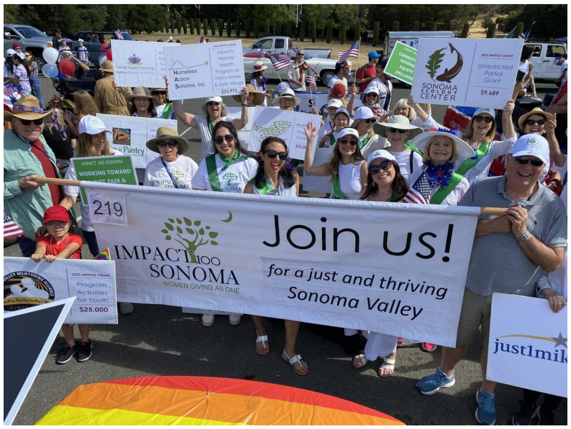
An enthusiastic group gathered for the morning start.

signs, and made a proud circuit around the Plaza to waves and cheers from the crowd lining the sidewalks.