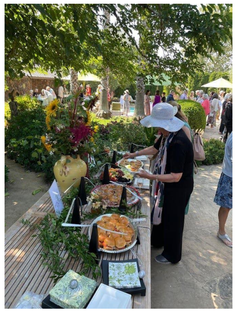
The buffet and small bites were catered by Whole Foods .